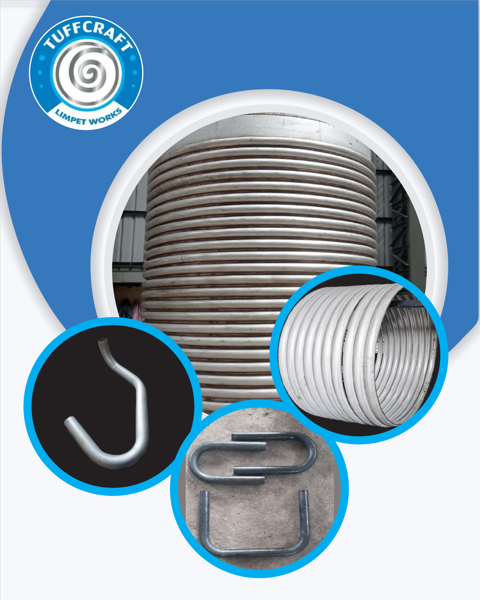
Tuffcraft Limpet Works (OPC) Private Limited